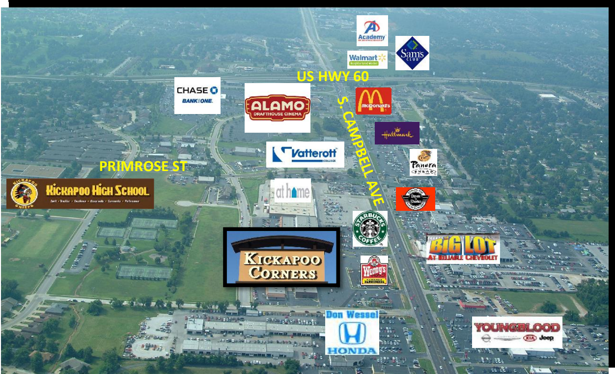
Kickapoo Corners View to the South